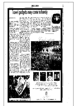
A crushproof, watertight, impact-absorbing case assures its contents remain safe and dry.