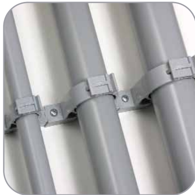
Interconnecting in all sizes for uniform row installation