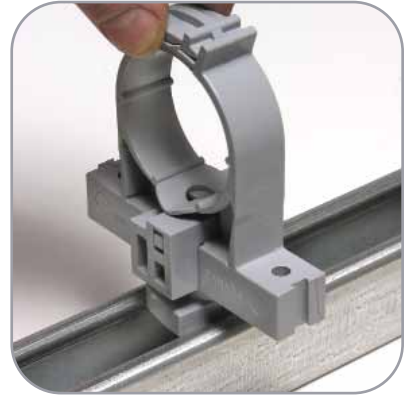
Strut mounting w/ accessory parts