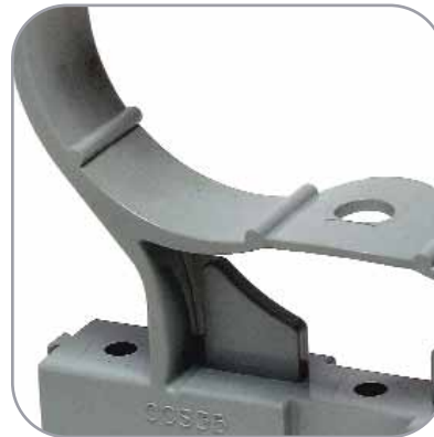
Friction reduction ribs to permit conduit expansion/contraction